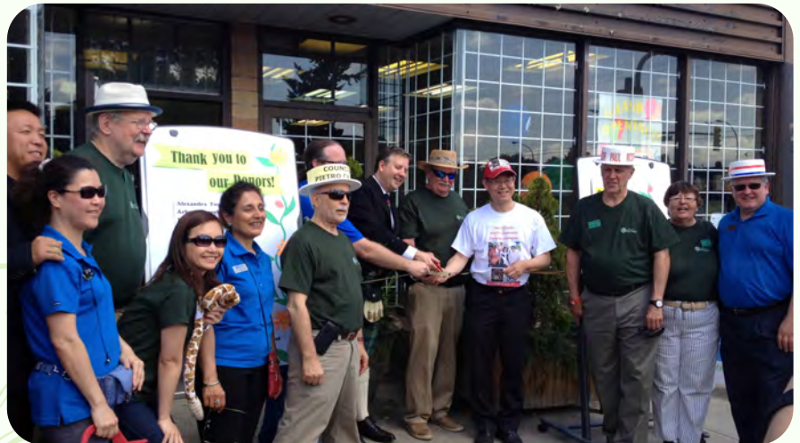
The opening of BNH North House in 2014