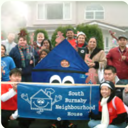
Edmonds Santa Claus Parade in 2004